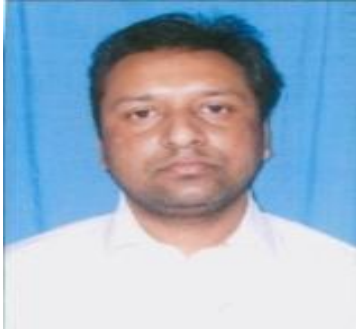
Shri Yusuf Azaz